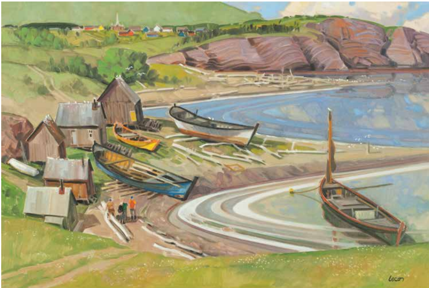
Petite Anse, 24" x 36"