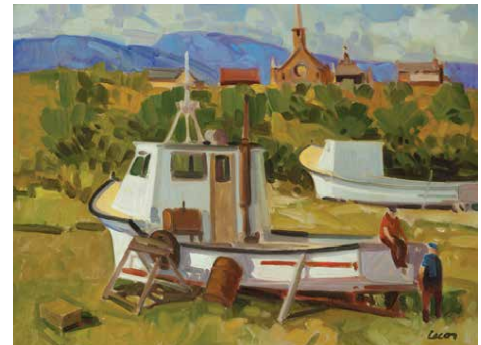
Grande Riviere, 20" x 24"