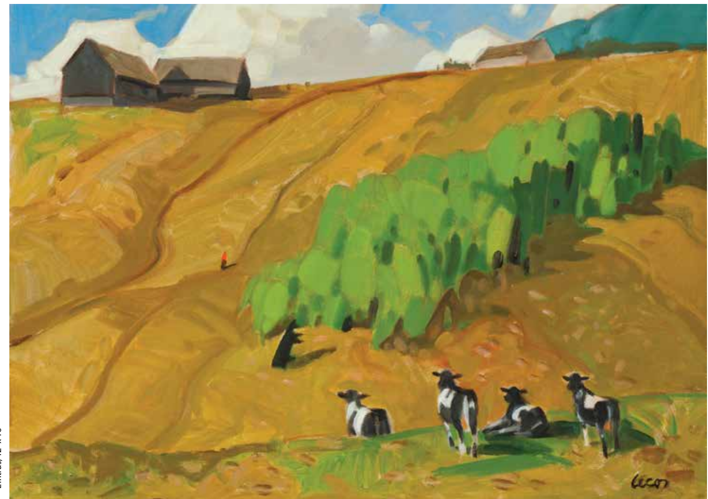
L'intrus, 12" x 16"