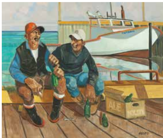
Et Tarzan Est Heureux, 20" x 24"

Paul 'Tex' Lecom has lived a life that most people starting out today could not recreate. Things were different back then, there was a belief that anything was possible. Today a lot of the magic in life is missing and without that sense of adventure it is hard to replicate the genius of Tex Lecom. A master storyteller, his paintings capture humour,