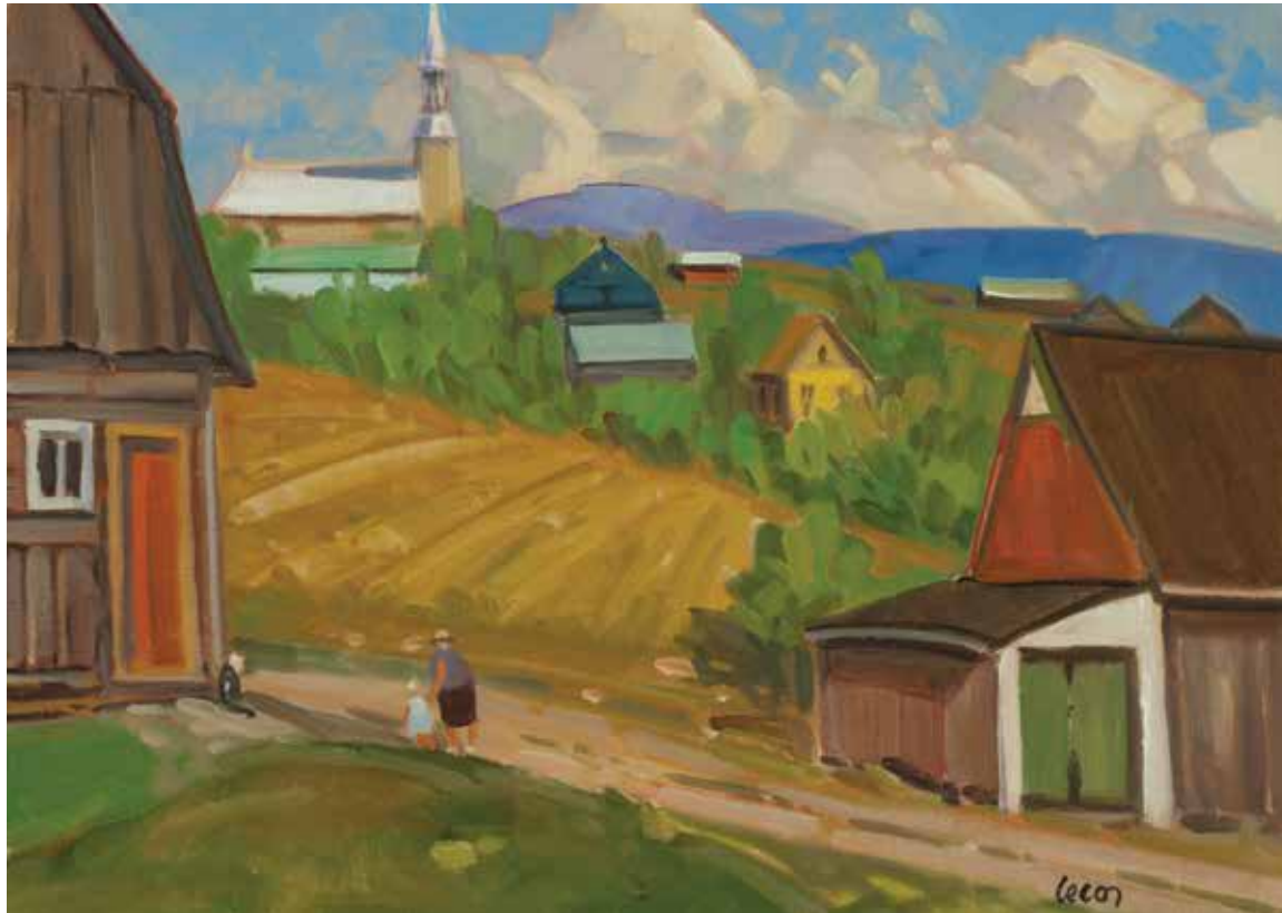
Les Éboulements, 12" x 16"