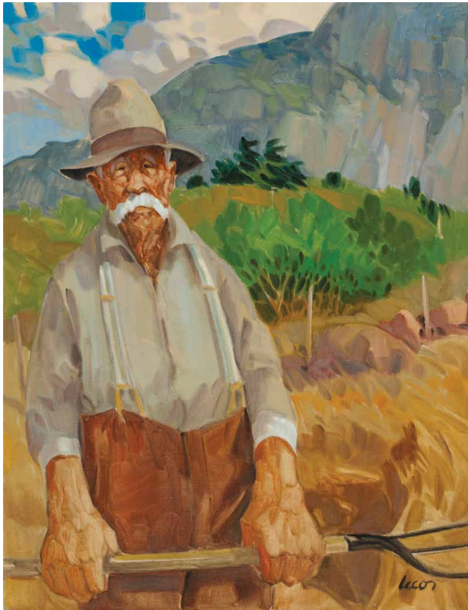
Victor Tremble, 20" x 16"