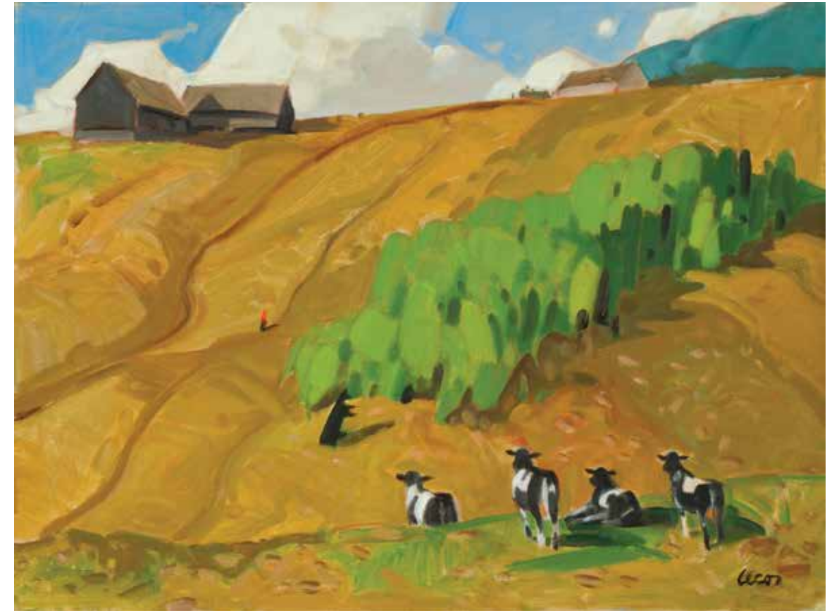
L'Intrus, 12" x 16"

solidify a reputation of excellence for both parties.