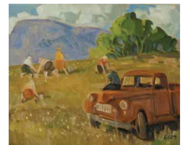
Les Ramasseuses, 11" x 14"