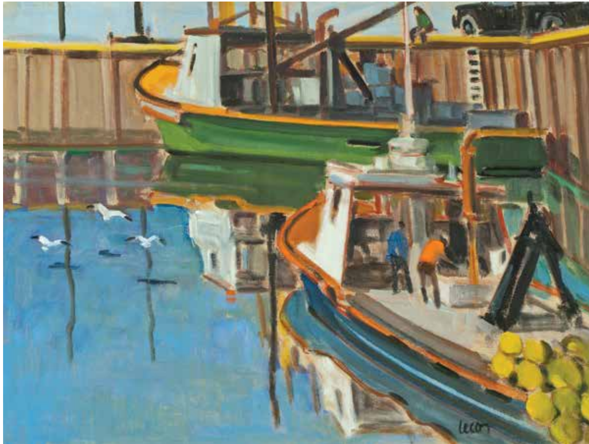
Retour Au Quai, 12" x 16"