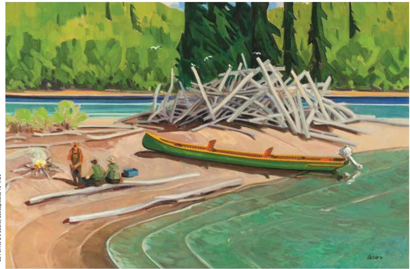
La Pointe De Sable, Cascapédia, 16" x 20"

The ability of Tex Lecor to use symbols and signs permits him not only to express his personal rebellion but to perfect his technique and master the art of composition as well. If his tones did not yet possess the brilliance of his later paintings,