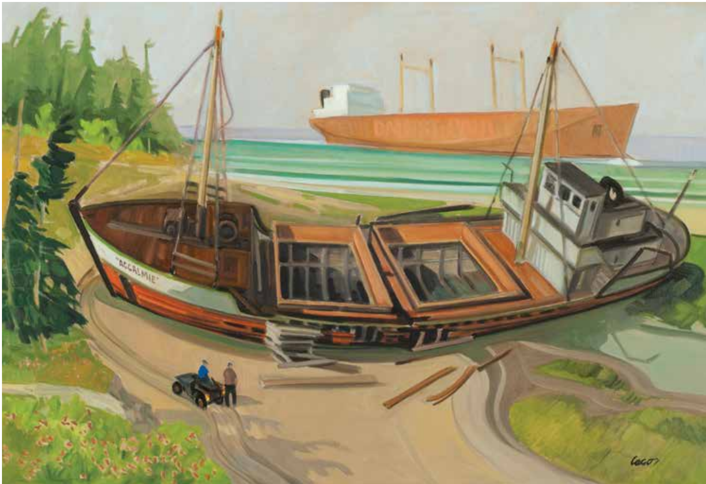
La Mort De L'acalmic, 24" x 36"

distinguishing him as a premier colourist, they, nonetheless, reveal a subtle harmony which provides the necessary balance to the painting. A perfect drawing supports the work of this artist. The paint is rich and generous; the brush stroke is solid and passionate.