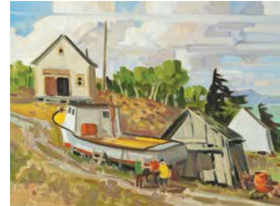
La Conférence, 12" x 16"

In 1972, following two years of immense productivity thanks to the time he now had to devote to painting, Tex Lecor met Denis