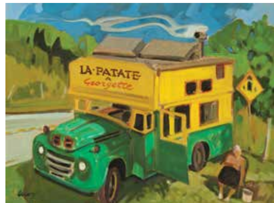
La Véture À Patates, 12" x 16"