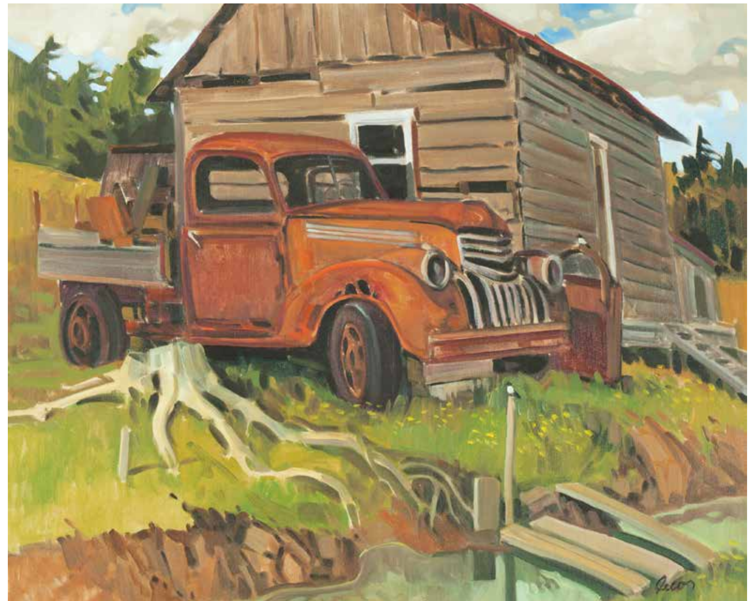
Le Chevrolet, St. Michel, 20" x 24"