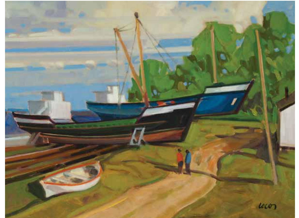
Le Musée, St. Joseph, 12" x 16"

At an age when most men seek rest and tranquility, something still pushes this talented artist to seek a muse that never fails to find him. Even though he occupies a larger than life