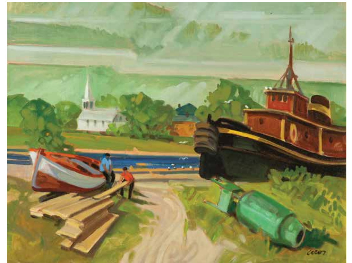
St. Joseph De La Rive, 16" x 20"