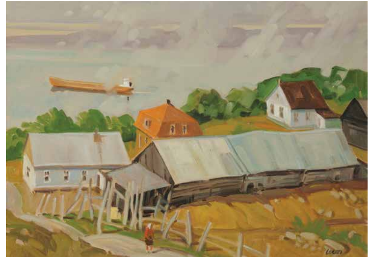
La Brume Se Lève, 16" x 20"

to come every night and hear him sing and tell tales. He considered turning to his other training in advertising but the thought of regular office hours and being told what to do was not a road he wished to pursue. For that reason music was a better choice.